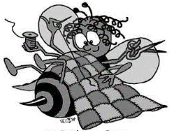
A Quilting Bee